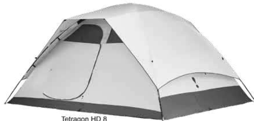
Tetragon HD 8

Watch video on tablets & other small electronics from the comfort of your sleeping bag. The clear center panel of the Media Center is touchscreen friendly. The Media Center attaches with hooks to pre-installed webbing loops located in each corner of the tent.