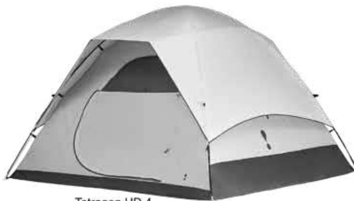
Tetragon HD 4