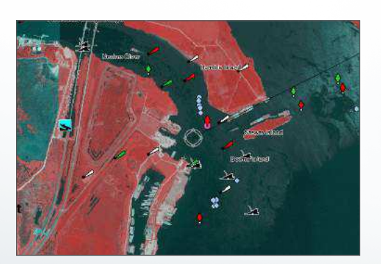
VIEW ALL THE HIDDEN FEATURES OF THE DELTA YOU'VE BEEN MISSING FROM TRADITIONAL MAPS