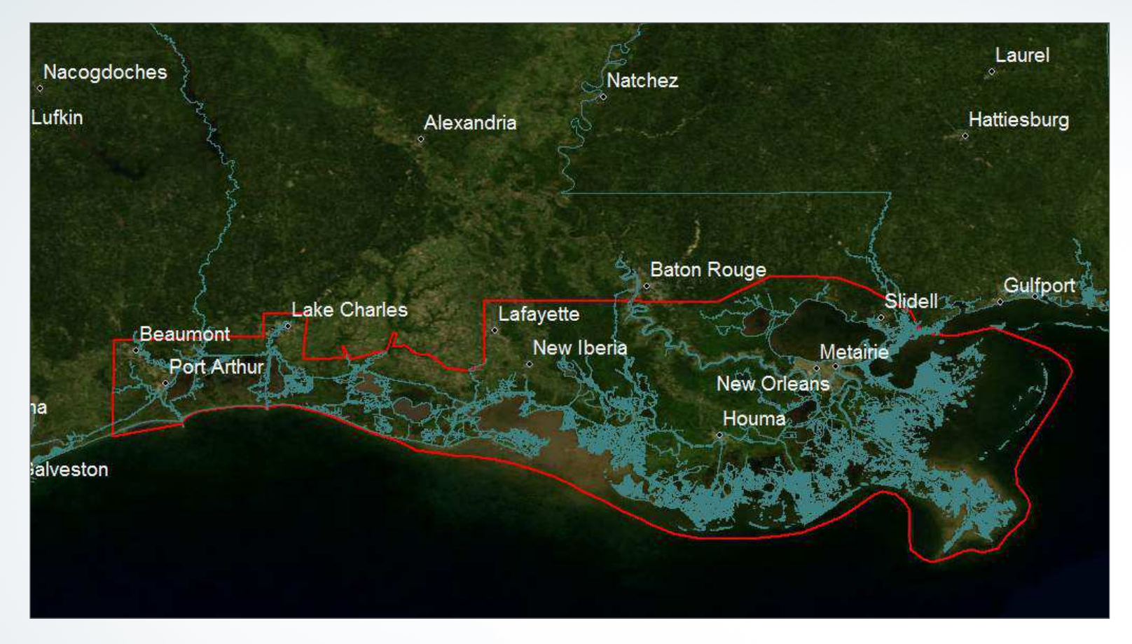
AutoChart map making capabilities exist within the red outline pictured above. Does not depict actual product aerial imagary.