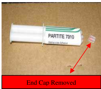
Fig # 2